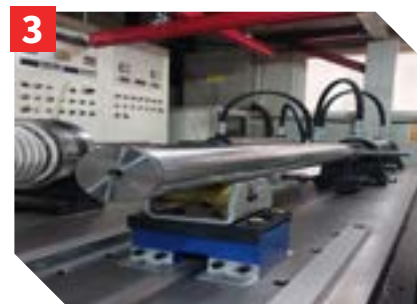
K3V / K5V Series