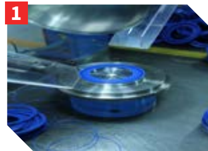
K3V / K5V Series

EA Parts is one of the major high quality seal kit suppliers and manufacturers in Korea supplying genuine and oem seal kits for all Korean and Japanese excavators. EA Parts is a seal kit manufacturer for HL Mando.