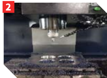
K3V / K5V Series